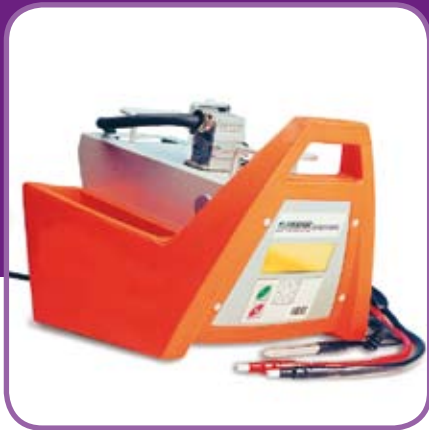
Welding equipment and accessories