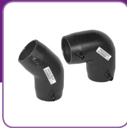
Electro fusion fittings